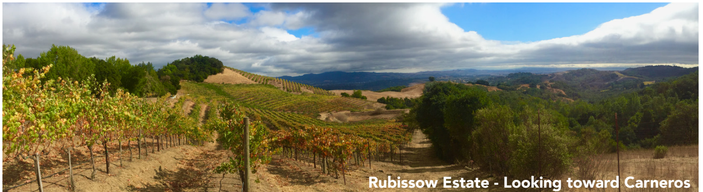
Rubissow Estate - Looking toward Carneros